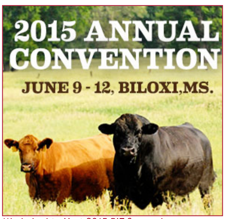
Mississippi to Host 2015 BIF Symposium

The 2015 Beef Improvement Federation (BIF) Symposium and Convention is scheduled for June 9-12, 2015, in Biloxi, Miss. Mississippi State University and the Mississippi Extension Service will host the event at the Beau Rivage Casino and Hotel in Biloxi.