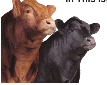
Genotyping Funding Ended