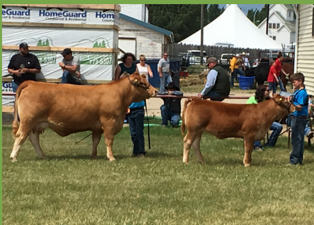
Swift Current 4-H Regional Show Supreme Champion Female RPY Chelsea 14C sired by Anchor B 'The Boss' Calf CJJ Shelby 1E sired by RPY Crossfire 28C shown by Calder Jones.