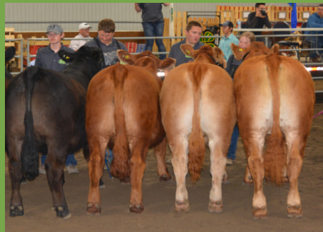
Champion Pen of 5 won by all Limousin steers from Stavely-Parkland 4-H Club at Willow Creek District 4-H Show.