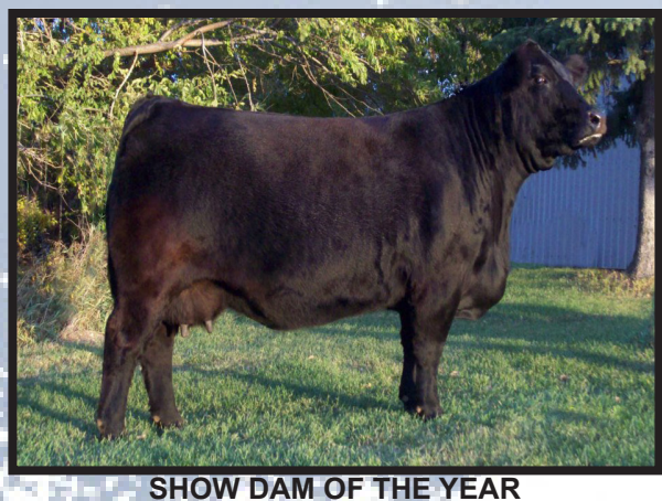
Greenwood Wisteria Lane owned by Greenwood Limousin & Angus