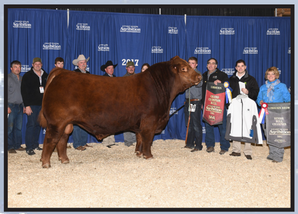
SHOW BULL OF THE YEAR Greenwood Canadian Impact ET owned by Greenwood Limousin & Angus and Nordal Limousin & Angus