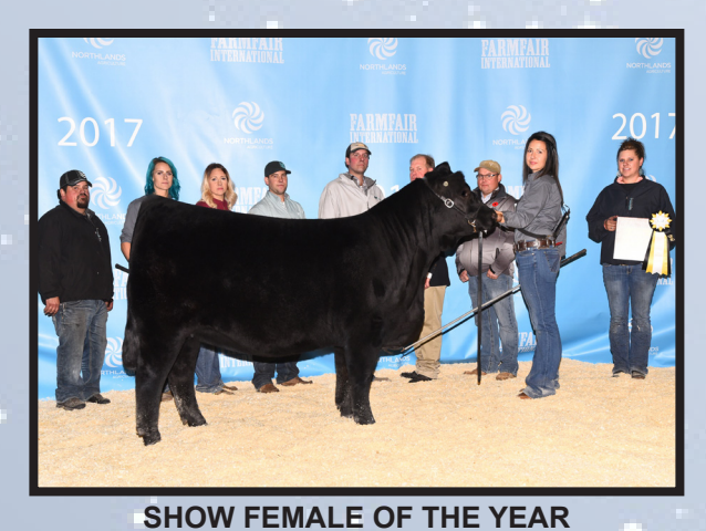
Boss Lake Day Dreamer owned by Boss Lake Genetics