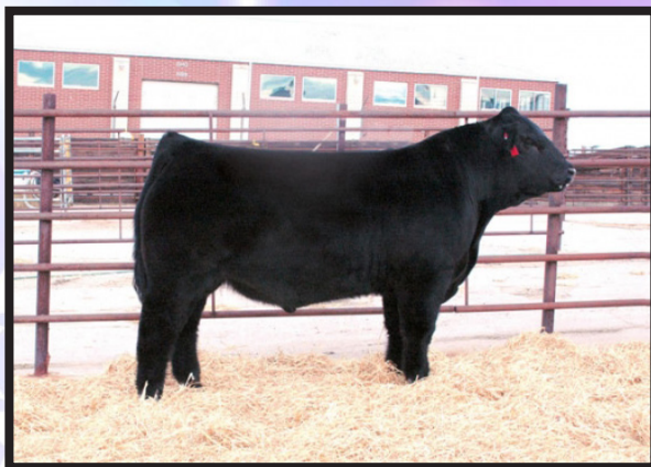
SHOW SIRE OF THE YEAR COLE Architect 08A Canadian semen rights owned by Payne Livestock