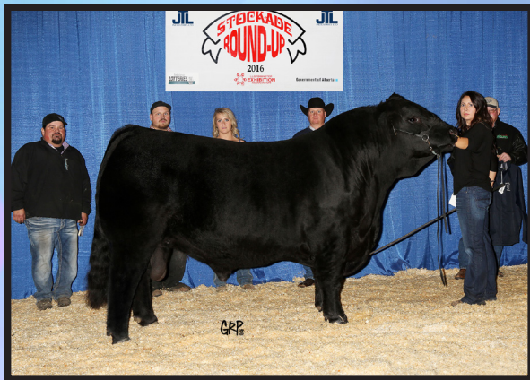
SHOW BULL OF THE YEAR Cottage Lake Big Star owned by Boss Lake Genetics & Skull Creek Ranches