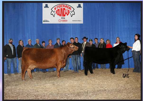
SHOW FEMALE OF THE YEAR Greenwood Pld Zoom Bloom owned by Greenwood Limousin & Boss Lake Genetics